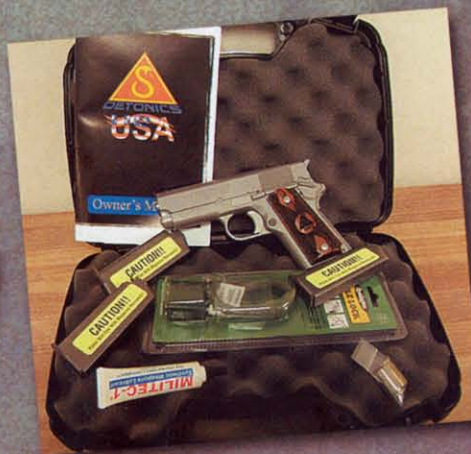
EAA's New New Dealer Direct Program from Detonics