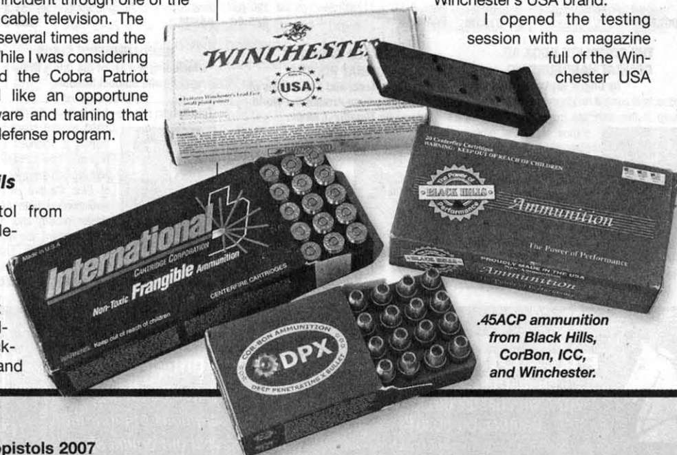
.45ACP ammunition from Black Hills, CorBon, ICC, and Winchester.

I opened the testing session with a magazine full of the Winchester USA