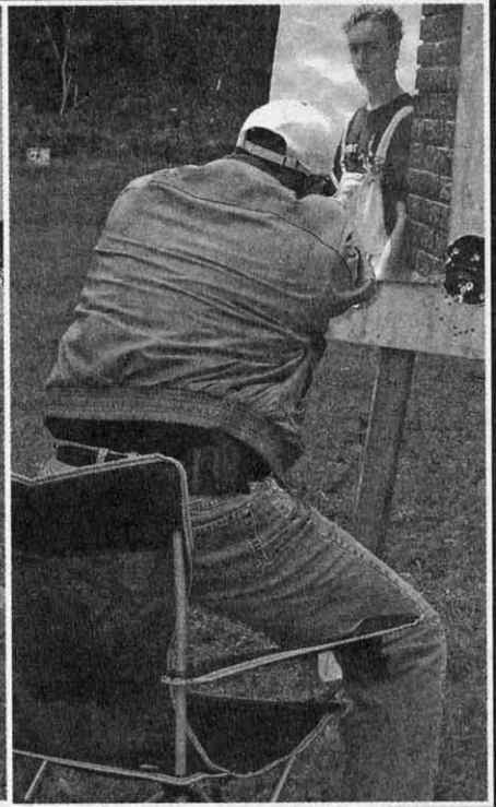
You won't always be standing at the ready when trouble comes. Practical training includes starting from a seated position.